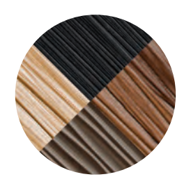
Wall Mount Cabinets & Credenzas are available in several configurations & many finishes.